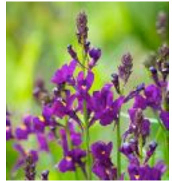
Gomphrena haageana orange, 'Strawberry Fields', 'Jewels of Opar', Linaria 'Rhythm and Blues'