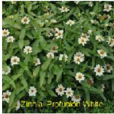
Zinnia 'Queen Lime', 'Queen Lime Orange', Queen Lime Blush', Profusion White'