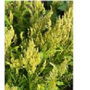
Calendula 'Canteloupe', Centaurea 'Old fashioned Mix', Celosia 'Ruby Parfait', Celosia 'Psyllid'