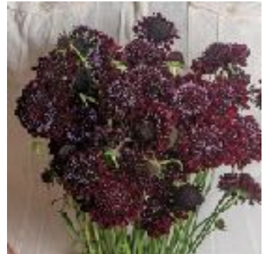
Nicotiana sylvestris, Purple Perfume, Nigella 'Love in the Mist', Scabiosa 'Black Beauty'