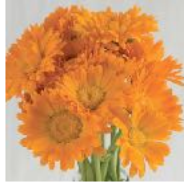
Amaranthus 'Coral Fountains', 'Green Cascade', 'Oeshberg', Calendula 'Alpha'