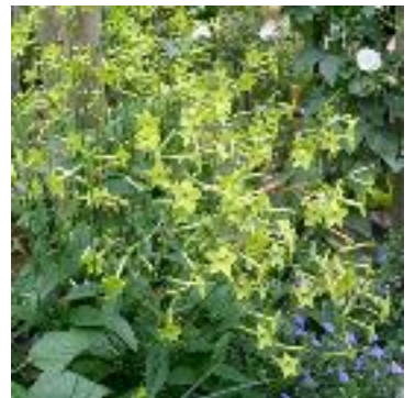
Mirabilis 'Orange Crush, Nicotianas 'Starlight Dancer', 'Cranberry Isle', "Lime Green"