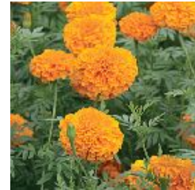
Zinnia 'Zowie', Tapetes (Marigold) 'Giant Yellow, Giant Orange'