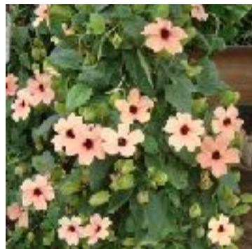
Browalia americana, Thunbergia alata alba, 'Blushing Susie'