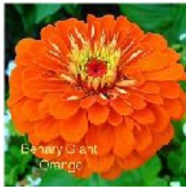
Zinnia 'Benary Giant Salmon Rose', 'Giant White', 'Giant Scarlet' and 'Giant Orange'