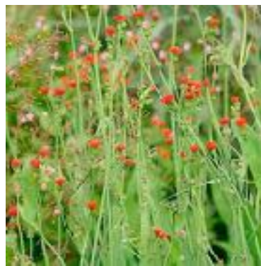
Dahlia 'Gitt's Cray', 'Preference', Daucus 'Dara', Emila javanica